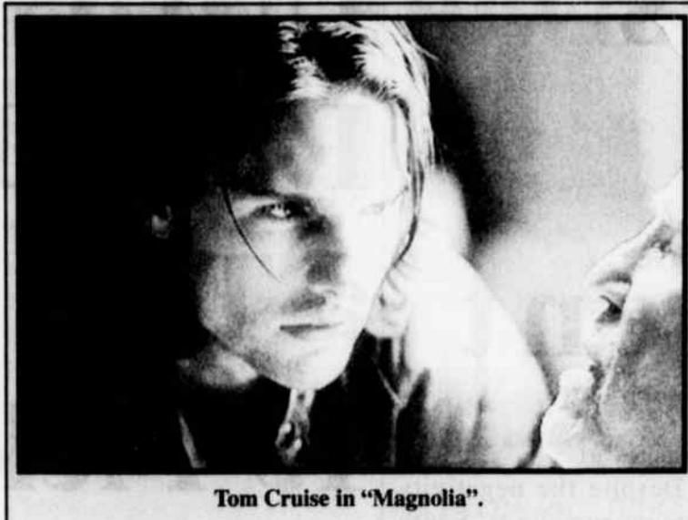
Tom Cruise in "Magnolia".

The characters in Magnolia exhibit the frailties, jealousies, confusions, and loneliness that are present in ourselves, but are too painful to recognize and confront. The story masterfully moves from scene to scene, each building on the previous scene until the striking realism becomes too apparent to reject as only a