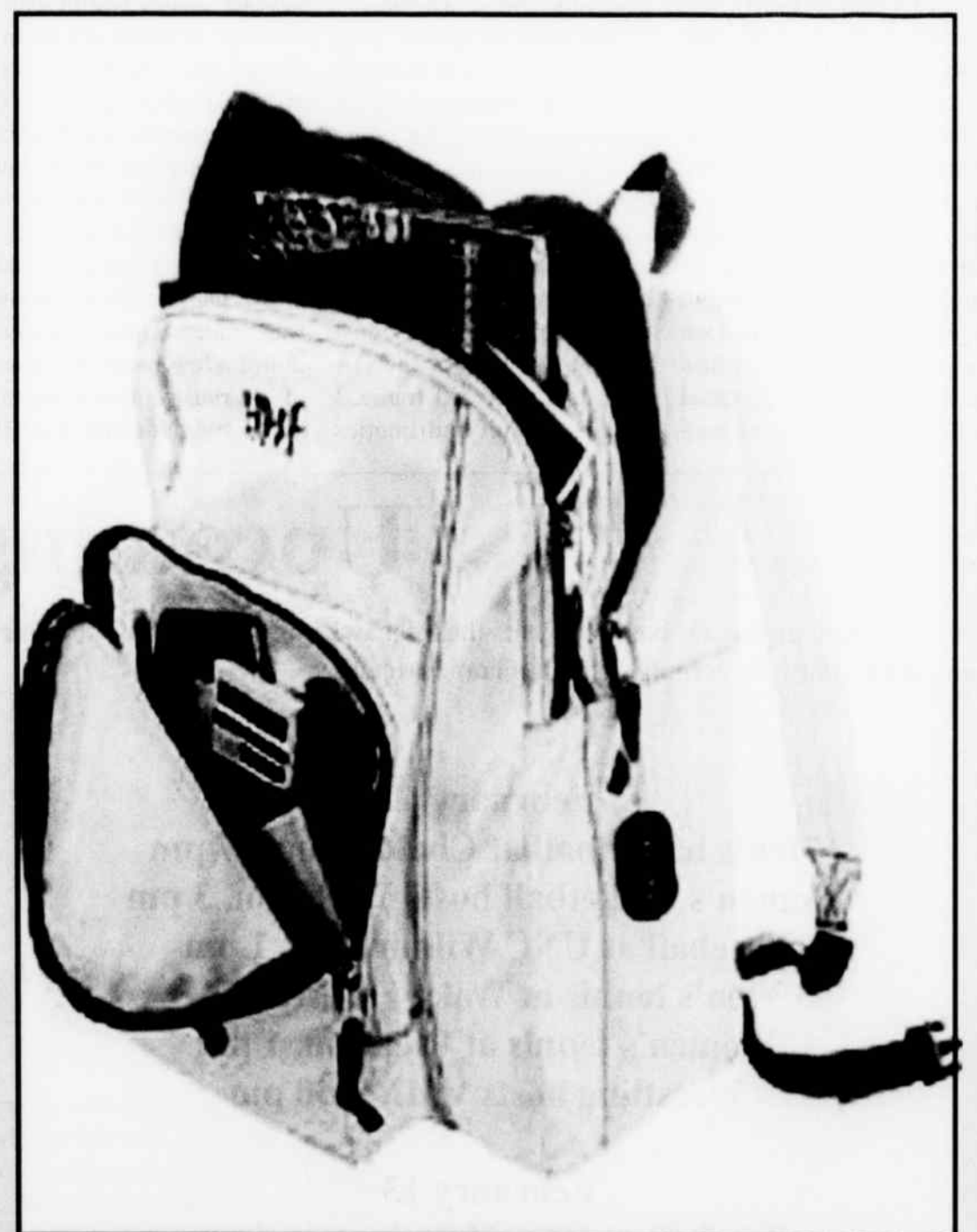
Not the bookbag in question, but it could have been.