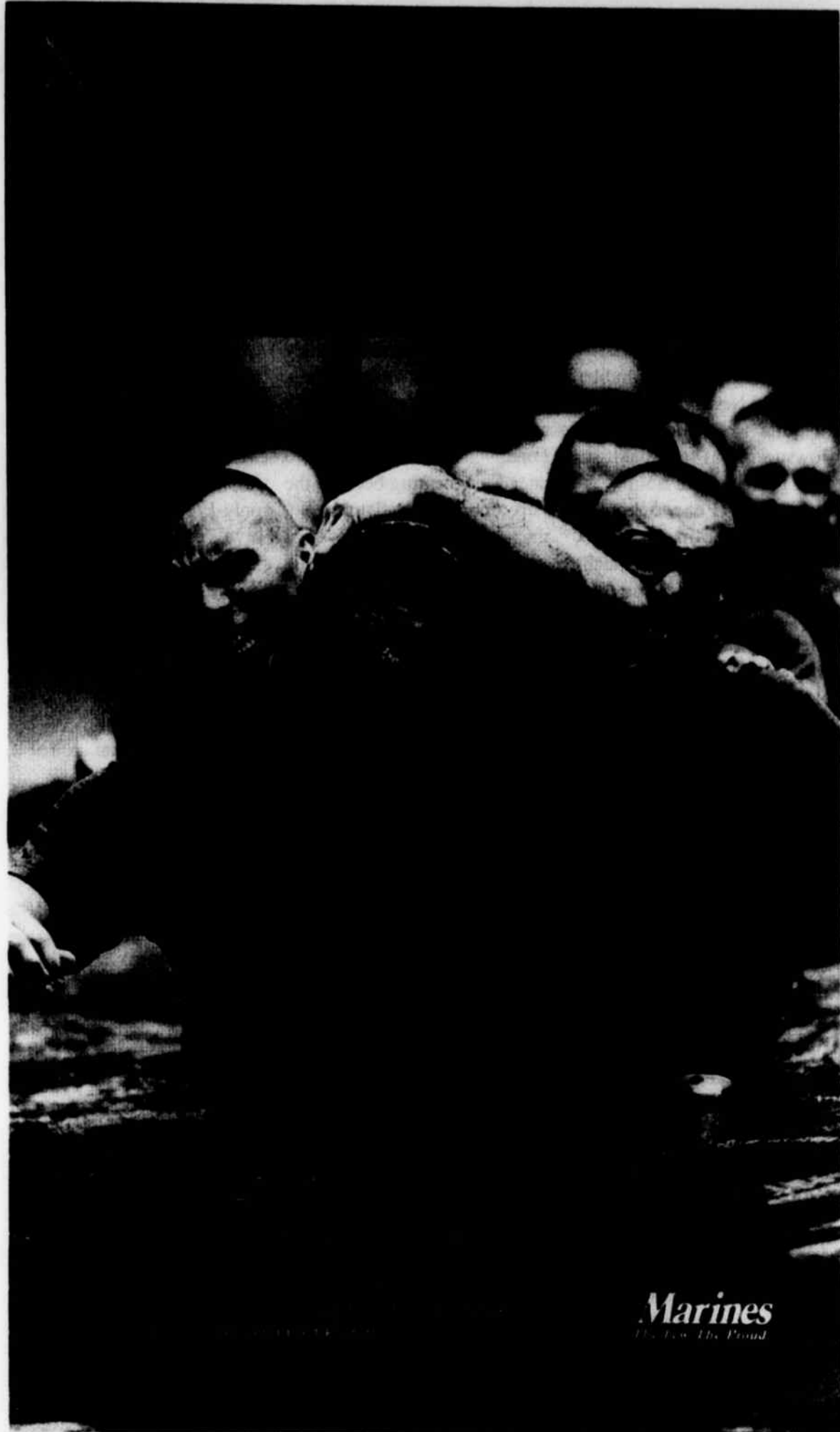
Marines The Few. The Proud.