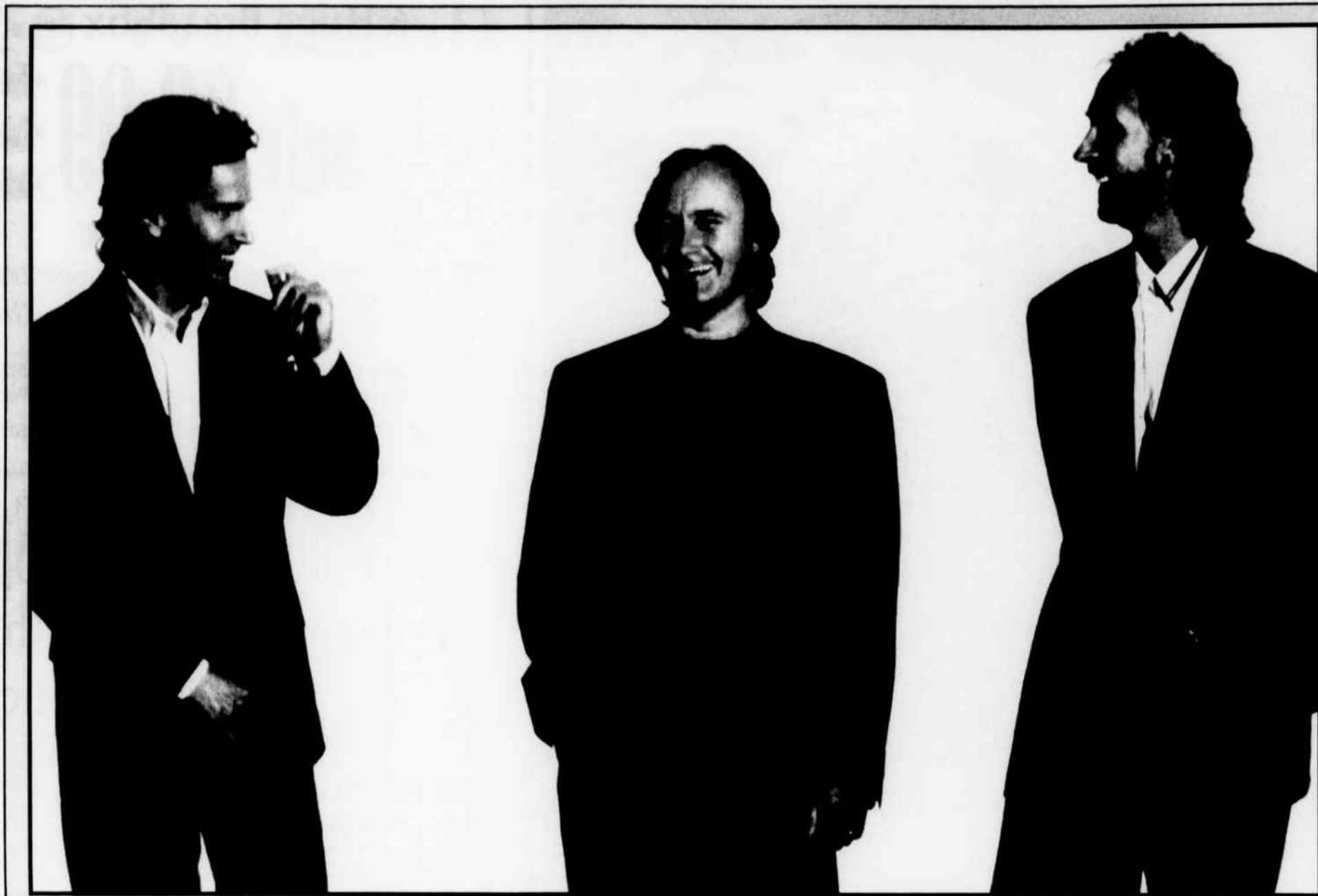
Genesis (from left to right): Tony Banks, Phil Collins, Mike Rutherford

When Gabriel stepped out of the group in the late 70s, and Collins retired his drumsticks for the mic, Genesis hit stardom. Their first post-Gabriel album, "And Then There Were Three," wasn't a huge success, but the track "Follow You, Follow Me" makes it onto the new Hits album. The track itself is undeniably colored by the memory of Gabriel. Collins' voice is still a little unsure, and a happy, softened steel drums, sing-a-long sound