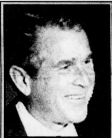
George W. Bush gives a happy smile for the camera.

Political "experts" and pollsters had roundly expected Bush to defeat McCain, if not easily, at least solidly. The actual outcome of the primary was not what any pundit ex-