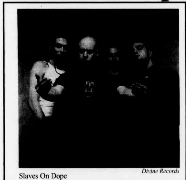
Slaves On Dope

Slaves on Dope produce a definite metal sound and throw in some really good lyrics on their debut major label album, Inches From the Mainline, released on October 3 of this year. The first track, entitled "Brotherly Love," is a very brief recording of a man talking about how proud he is of his brother who is a drug addict. The title track describes the progression of a drug addiction, from getting high for the first time, to being "Inches