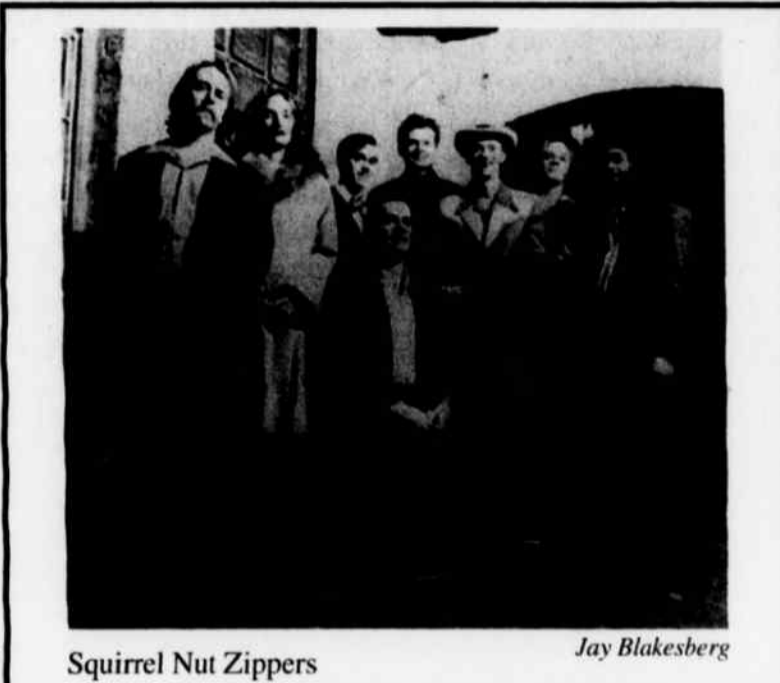
Squirrel Nut Zippers