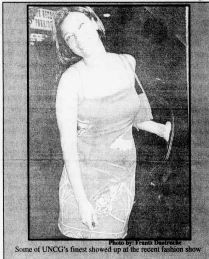
Some of UNCG's finest showed up at the recent fashion show

The Fashion show exhibited business attire, sleepwear, and eveningwear. Clothing and products worn by models came from Clinique at Hecht's,