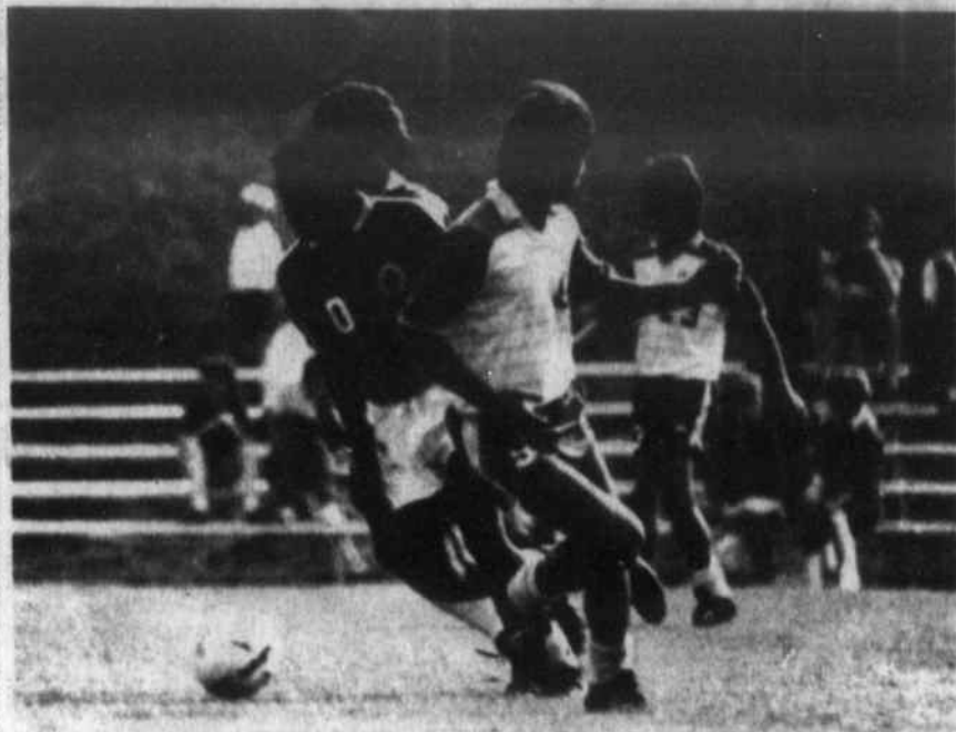
UNC-G PLAYS Winthrop College this Saturday at 2:00 p.m.